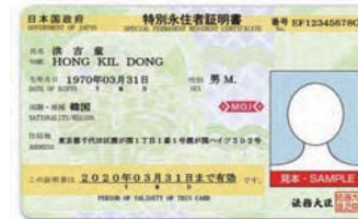
Special Permanent Resident Card