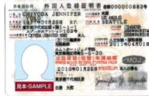
Alien Registration Card