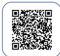
Link to Google MAP™

KICC Sannomiya Nihongo Plaza Sannomiya Building East 5F, 6-1-12, Goko-dori, Chuo-ku, Kobe