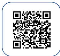
Link to Google MAP™